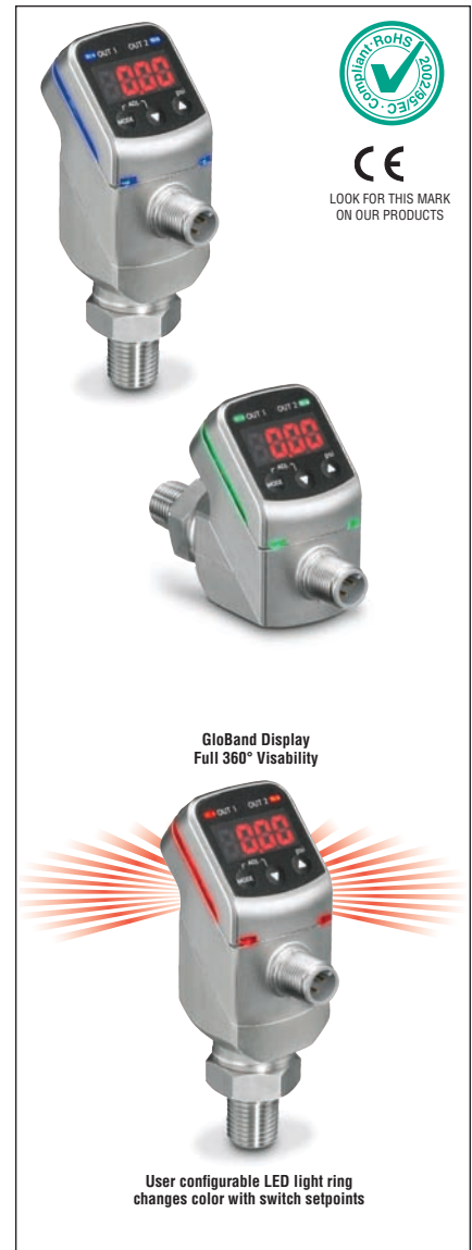
GloBand Display Full 360° Visiblity

Media: Fluids and gases compatible with 316SS pressure connection and 17-4pH SS (sensor diaphragm)