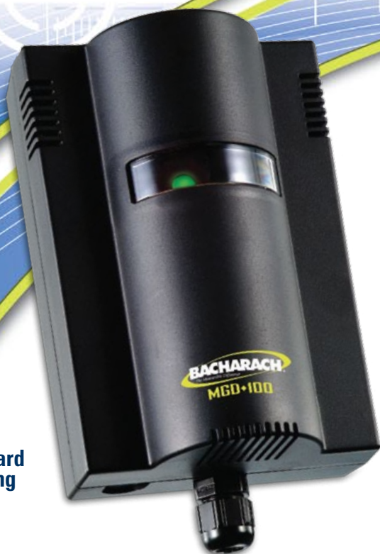
MGD Standard Housing

Ideal for Chiller Rooms, Supermarkets, Brewing and Bottling Facilities, Industrial Refrigeration, Arenas, Food Storage and Processing Facilities.