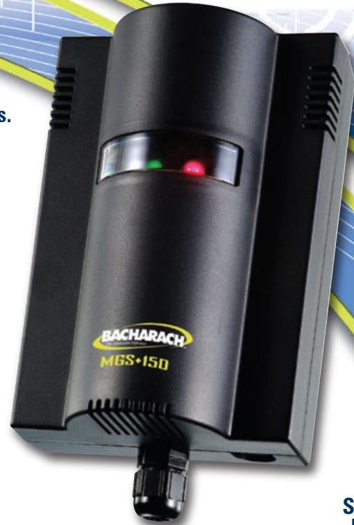
MGS Standard Housing