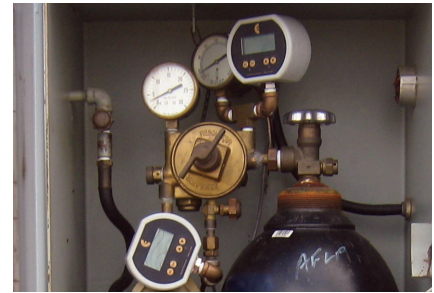
Substation Transformer Nitrogen Blanketing

Compensated temperature: 32 to 158°F (0 to 70°C)