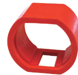
RB Rubber Boot