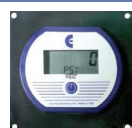
-PM Panel Mount