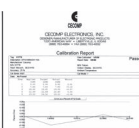
NC NIST Cert.

Cecomp maintains a constant effort to upgrade and improve its products. Specifications are subject to change without notice. Consult factory for your specific requirements.