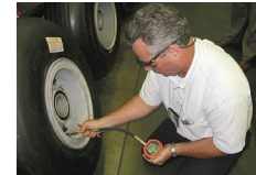
-TP Top Port Option