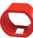
RB Rubber Boot