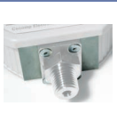
-CS Case Stiffener