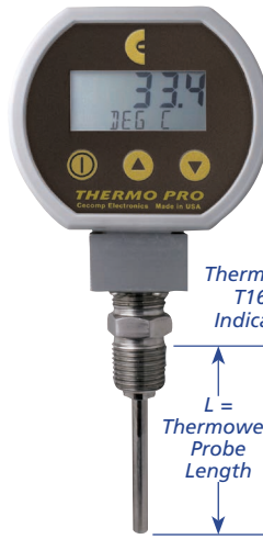
ThermoPro T16B Indicator