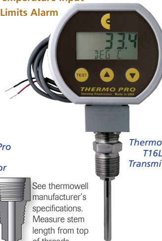
ThermoPro T16L Transmitter