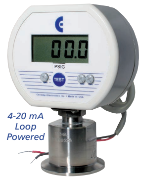
4-20 mA Loop Powered