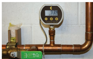
Air Dryer Outlet Temperature