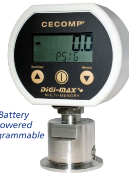
Battery Powered Programmable