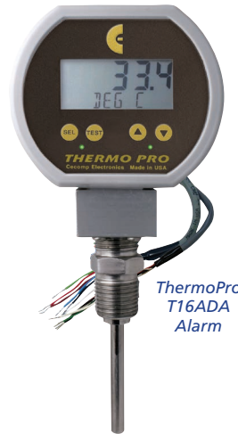
ThermoPro T16ADA Alarm