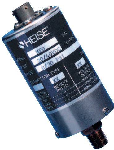
Shown with optional Bendix PTO connection