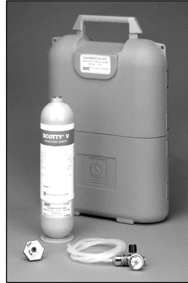
Model 1250-01 Calibration Kit Type A (with cylinder)

The 1250-XX Calibrator Kit is used to deliver calibration gas for combustible gases and a wide variety of toxic gas detection modules including Carbon Monoxide, Hydrogen, Combustible Gas, Hydrogen Sulfide, Chlorine, Sulfur Dioxide, Nitric Oxide, Nitrogen Dioxide and Zero Grade Air. Other gases are available, contact Sierra Monitor for the latest information. There are three versions of the calibration kit available depending upon the specific calibration gas required. Each kit contains a regulator, calibration adapter and carrying case. The individual calibration gas cylinders (Series 1260) are sold separately.