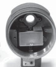
AC103133 mounting kit

▼ = STANDARD OPTIONS Specifications subject to change