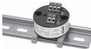
Temptrons mounted to DIN rail