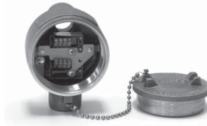
AC103528 mounting kit

Use AC103133 for connection head models CH104, CH106 and CH306, and CH356. CH106, CH306 and CH356 also require AC103625 connection head modification.