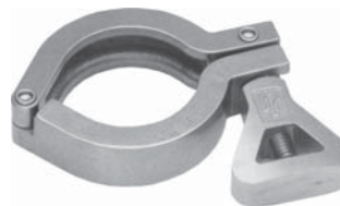
Clamp for sanitary fitting

▼ = STANDARD OPTIONS Specifications subject to change