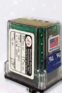
API 4003 G I

Transmitters: 3-way power/input, power/output, I/O