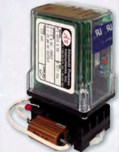
API 6010 G 5A