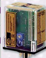
API 4008 G