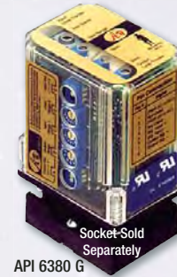
API 6380 G Socket-Sold Separately