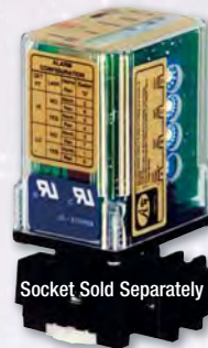
Socket Sold Separately