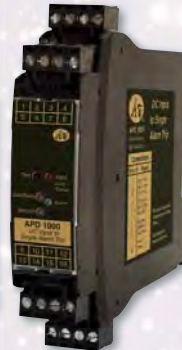
APD 1000 DC Input Single Alarm