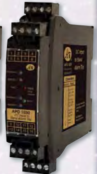
APD 1030 DC Input Band Alarm