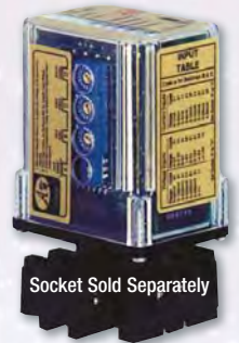
Socket Sold Separately