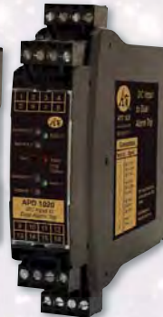
APD 1020 DC Input Dual Alarm