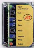
API 1040 G