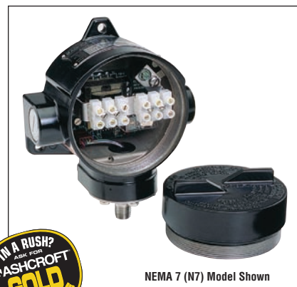
NEMA 7 (N7) Model Shown