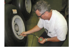
-TP Top Port Option