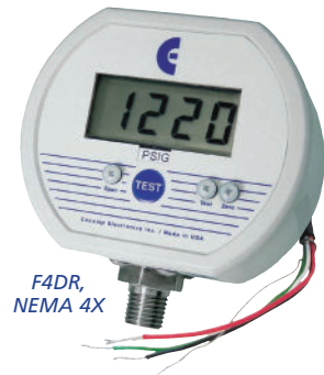
F4DR, NEMA 4X