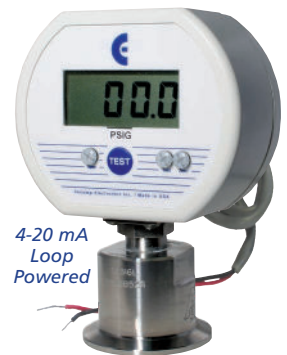
4-20 mA Loop Powered