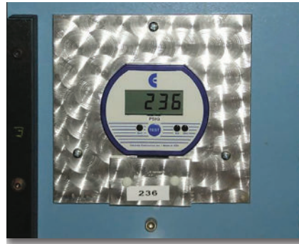
Pipe Pressure Testing System

Operating temperature: -4 to 185°F (-20 to 85°C) Compensated temperature: 32 to 158°F (0 to 70°C)