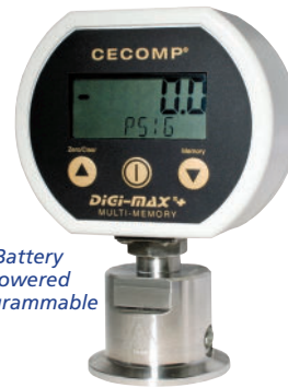
Battery Powered Programmable