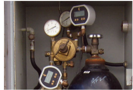
Substation Transformer Nitrogen Blanketing

Compensated temperature: 32 to 158°F (0 to 70°C)