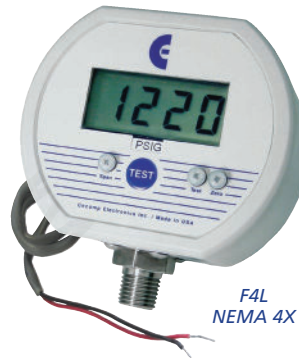
F4L NEMA 4X