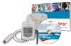
EBI 20-TF-Set Temperature logger set (logger with external probe up to +100 °C (+212 °F), evaluation software, interface)