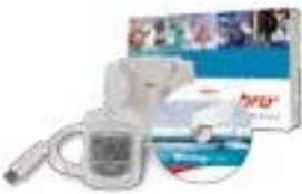
EBI 20-T1-Set Temperature logger set (temperature logger, evaluation software, interface)