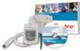
EBI 20-TE1-Set Temperature logger set (logger with external probe, evaluation software, interface)