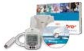
EBI 20-TH1-Set Temperature Humidity Logger Set (Logger, Evaluation software, Interface)