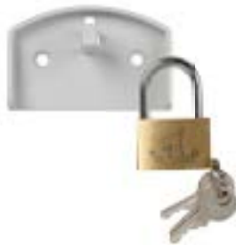
EBI 20-WM wall bracket