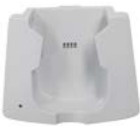
EBI 20-IF Interface