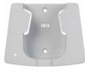
EBI 20-WM-1 truck wall bracket